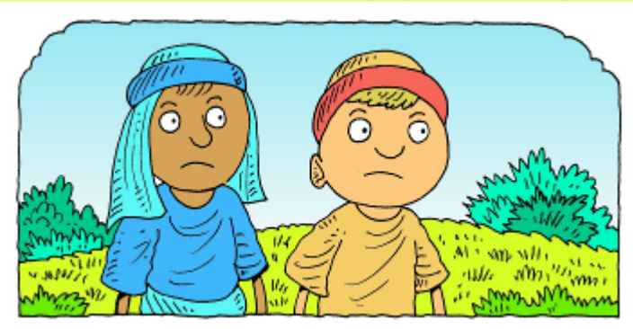
Two friends were walking home along the road to Emmaus feeling sad. While they had been in Jerusalem Jesus had died on the cross.