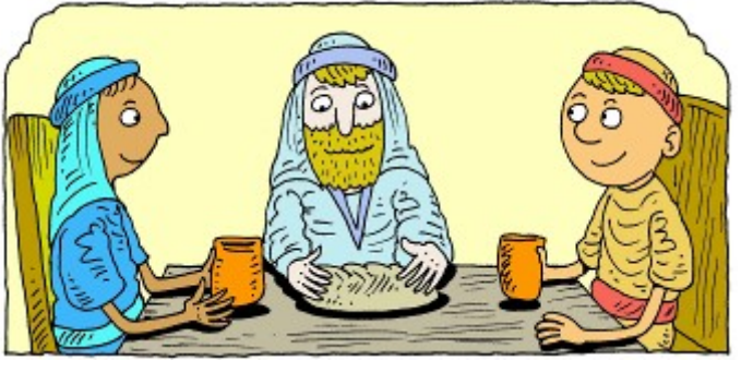
When they got to their house they invited the stranger in for a meal. He took the bread, broke it and thanked God that Jesus had died for them.