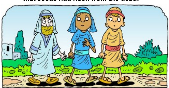
The stranger told them how everything that had happened to Jesus was part of God's plan. His words gave them hope.