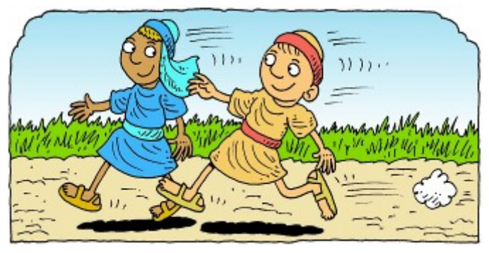
They ran straight back to Jerusalem to tell all Jesus' friends they had seen Jesus and everything he had told them that was written about Him in the Bible.