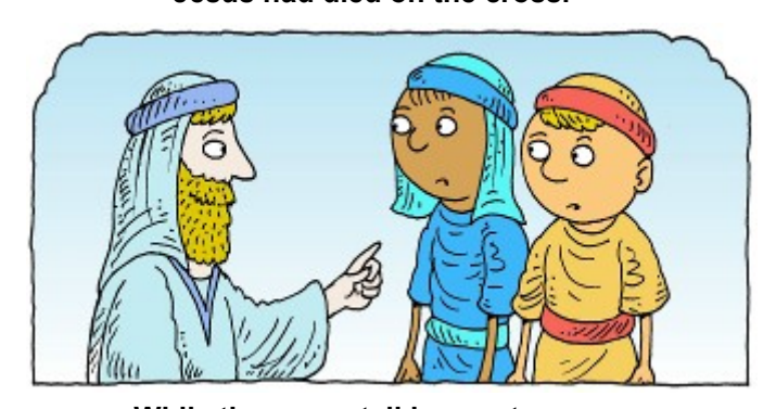
While they were talking, a stranger began to walk with them. "Why are you so sad?" he asked. "All these things are written in the Bible."